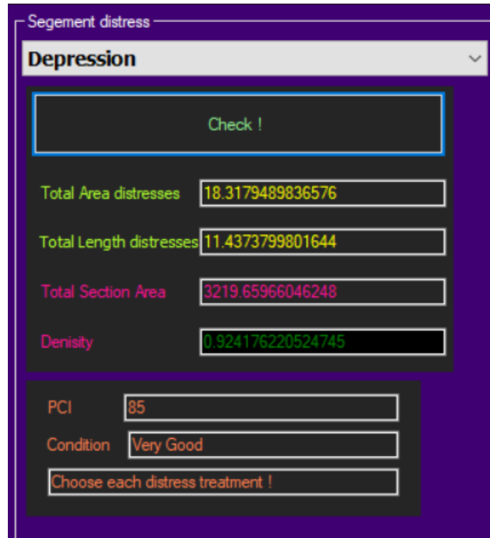
FIGURE 4. Check of the segment pavement condition index (PCI).

are inserted, the pavement condition index is calculated. Then, the PCI value is inserted in the model, and the road condition, total distress quantity, and density are displayed by clicking on the “Check” button, as shown in Fig. 4.